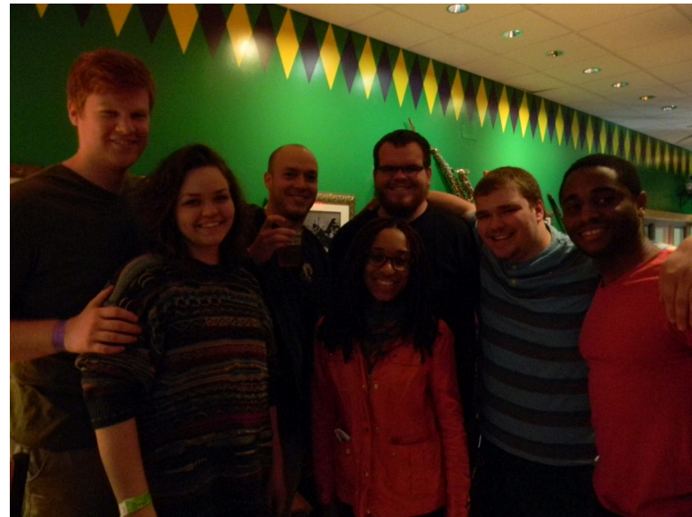
Team HSC after placing 2nd for the Semester in Flat Tuesdays' Trivia Competition

And stay tuned for our independent website (Still under construction)